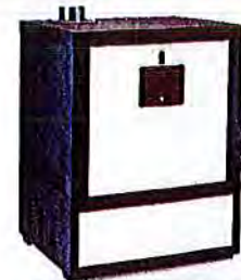
ETI400 400K BTU GAS HEATER WITH ASME HEADER PER FIRE CODE